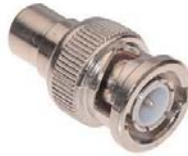
CN-ADP515 BNC M to RCA F