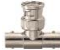
CN-ADP505 BNC-T-2 Female-1 Male