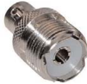
CN-ADP504 BNC F to UHF F