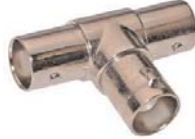
CN-ADP506 BNC-T-3 Female