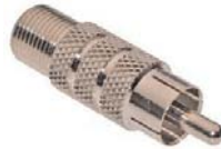
CN-ADP103 RCA M to "F" Female