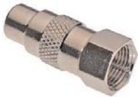
CN-ADP106 RCA F to "F" Male