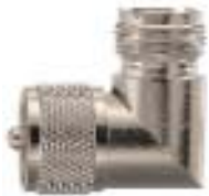
CN-ADP205 UHF RA Male to Female