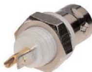
CN-ADP-ST BNC Bulkhead - Tab