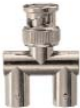
CN-ADP523 BNC 2 Female - 1 Male Goal Post