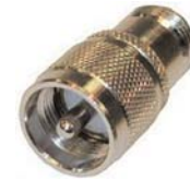
CN-ADP805 UHF Male to "N" Female