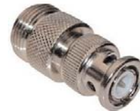
CN-ADP807 BNC M to "N" F