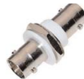
CN-ADP521 BNC F to F Iso.Bulkhead