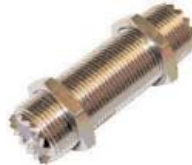
CN-ADP207 Inline UHF ( F to F )