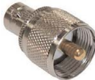
CN-ADP500 BNC F to UHF M