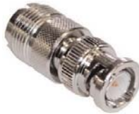
CN-ADP512 BNC M to UHF F