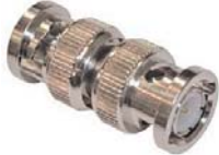
CN-ADP511 BNC M to M