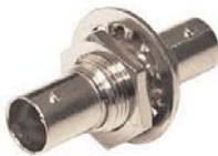
CN-ADP756 75 ohm BNC F to F Bulkhead