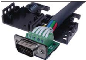
CN-MX15M With Hood CN-MX915H