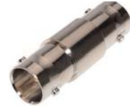
CN-ADP755 75 Ohm Splice