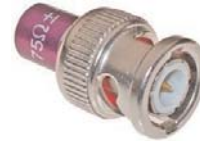
CN-MT-50 50 Ohm BNC Terminator